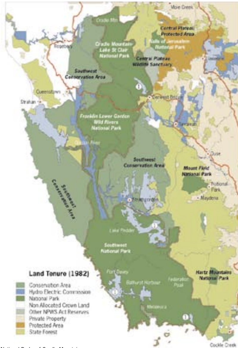
1 Status at Listing (1982)