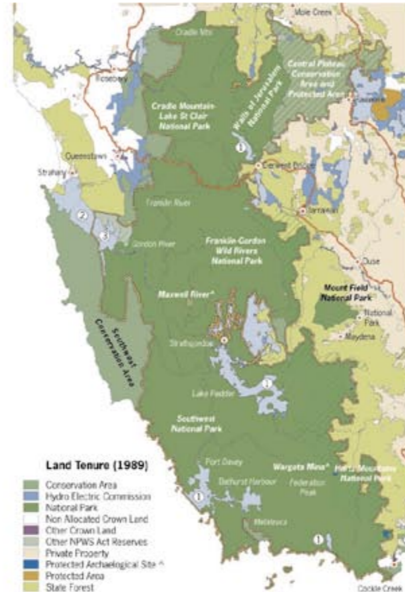
2 Status at Extension (1989)