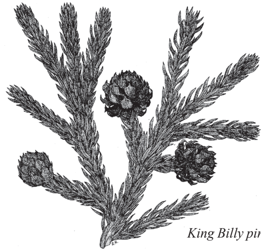
King Billy pine

The endemic plants comprise only a small part of the total number of species in the Cradle Mountain area and hundreds of plants growing in this area are native to Australia.