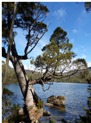
Pencil pines at Shadow Lake

Near Shadow Lake the vegetation changes to sub-alpine forest. Snow gums, buttongrass and sedges flourish and pencil pines fringe the lake edge. The lake contains introduced brown and rainbow trout. These can be fished if you have a licence. Picnic spots can be found around the lake edge but please remember that campfires are not permitted. Forgotten Lake is approximately 20 minutes from Shadow Lake mostly walking along