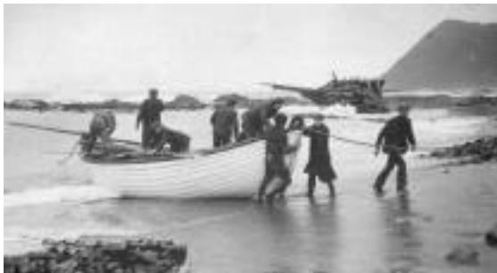
A whaleboat landing.

For an hour, the crew battled strong seas, but made no headway. The rowers realized that if they continued, they would completely exhaust themselves and all lives would be lost. They then made the painful decision to abandon the jolly boat, with its crew of sick men, so they could row to shore.