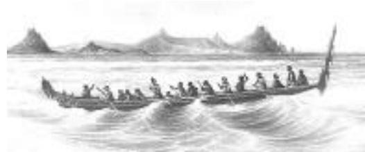
A Maori canoe, sketch by Augustus Earle.