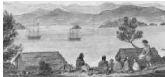
Bay of Islands, New Zealand, sketch by Augustus Earle 1827.

After twelve hours of rowing, the whaleboat reached the coast. Only eight men made it to shore alive: Captain Goodenough, Thomas Rodgers, Thomas Hunt and five Lascars, whose names have not been recorded. One of these Indians died soon after landing. On 1 November 1815, Goodenough also died.