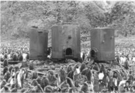
Digesters at Lusitania Bay installed by Joseph Hatch.

Hatch was born in London but moved to Melbourne, Australia, as a young man. He then moved to Invercargill, New Zealand, where he started many enterprises, including a bone mill, a rabbit-skin exporting business, a soap and glycerin manufacturing business. Once he bought a stranded whale for 30 pounds and processed its products. The biggest venture of Hatch's life, however, was the Macquarie Island elephant seal and penguin oil business.