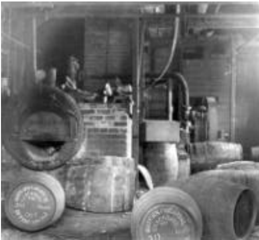
A digester plant operating at the Nuggets, 1895.